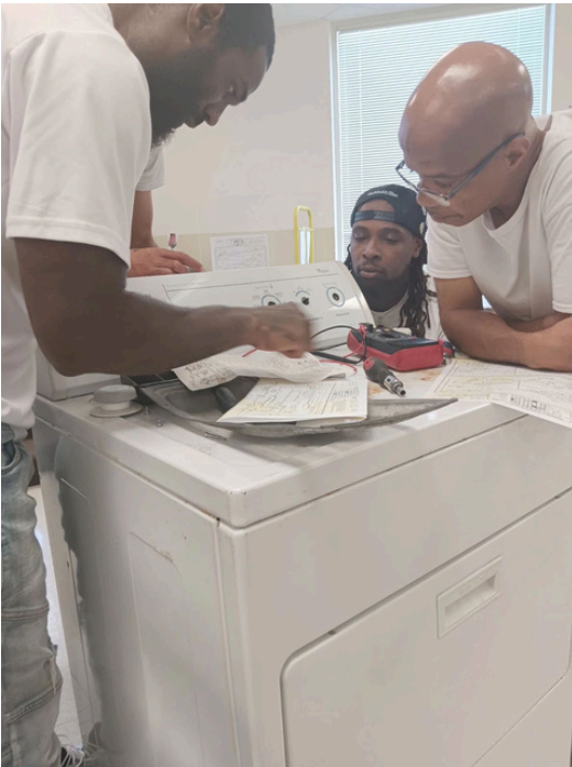
Uplift students training for washer/dryer repair work

Start a new career with Uplift's signature programs in HVAC or CDL Class B. Justice-impacted individuals receive FREE training, a transportation pass, daily lunch and a stipend. Uplift's caring team of case managers and instructors work with you to ensure your success!